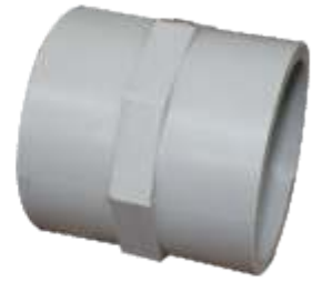
Size: 1/2" to 8"