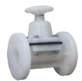
Size: 1/2" to 6"