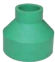
Size : 1/2" to 6"