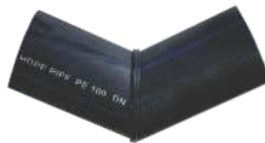
Size: 2" to 20"