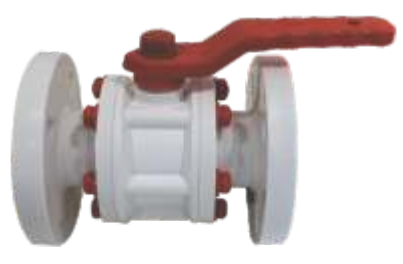
Size : 1/2" to 12"