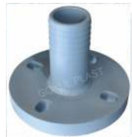
Size: 1" to 4"