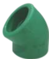
Size : 1/2" to 6"