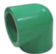
Size: 1/2" to 6"