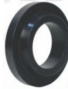
Size : 1/2" to 24"