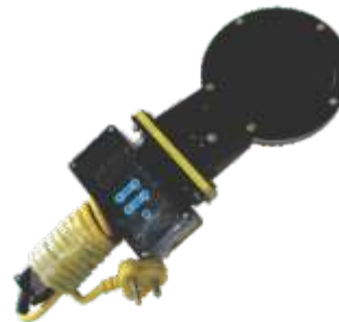
Size: 4" to 24"