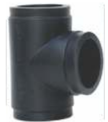
Size: 1/2" to 12"