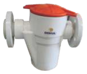
Size : 1/2" to 6"