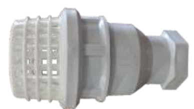
Size: 1" to 4"