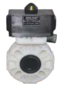
Size: 2" to 12"