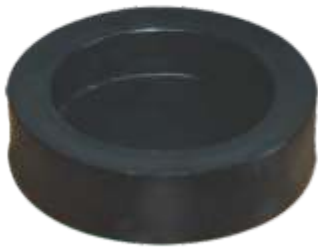
Size : 1/2" to 18"