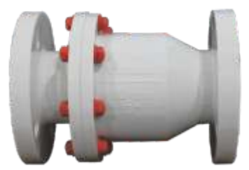
Size : 2" to 12"