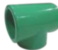
Size: 1/2" to 6"