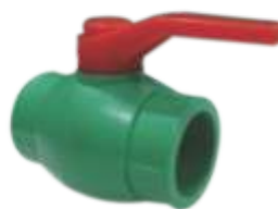
Size : 1/2" to 4"