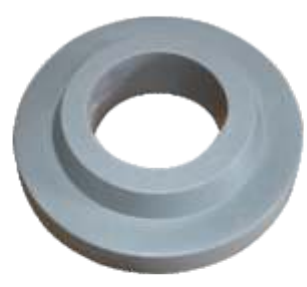
Size : 1/2" to 24"