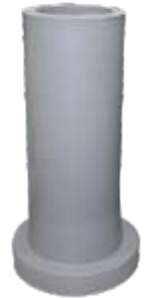
Size: 1" to 6"