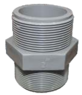
Size: 1/2" to 3"