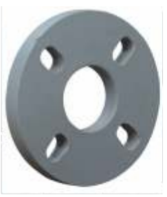
Size : 1/2" to 24"