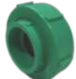
Size : 1/2" to 4"