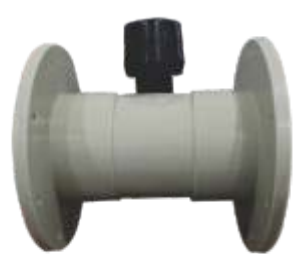
Size : 4" to 12"