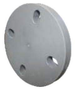
Size : 1/2" to 24"