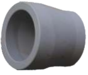
Size : 1/2" to 24"