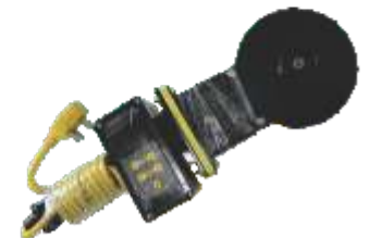
Size: 4" to 8"