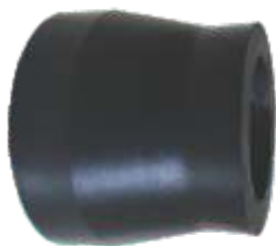
Size : 1/2" to 24"