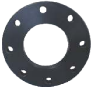
Size : 1/2" to 24"