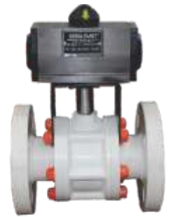
Size: 1/2" to 12"