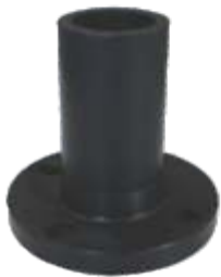
Size : 1" to 4"