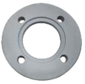
Size : 1" to 12"