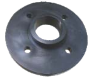
Size: 2" to 12"