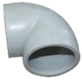
Size : 1/2" to 6"