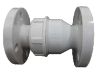
Size : 1" to 2"