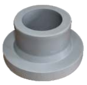
Size : 1/2" to 24"