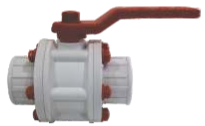
Size : 1/2" to 4"