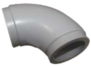
Size : 1/2" to 6"