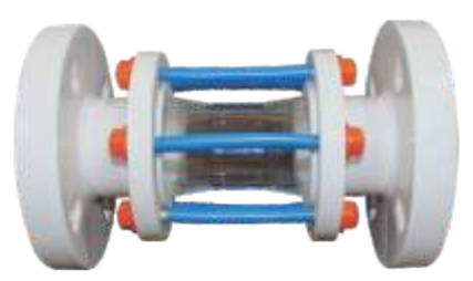
Size : 1" to 12"