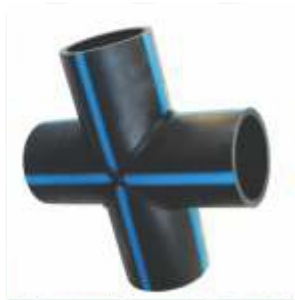
Size : 2" to 20"