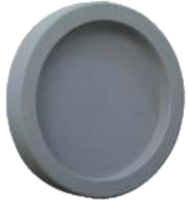
Size : 1/2" to 16"