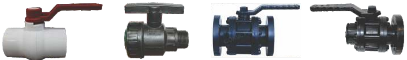
Size : 1/2" to 4"