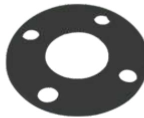
Size : 1/2" to 24"