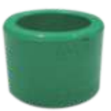
Size : 1/2" to 6"