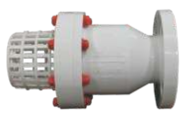
Size : 2" to 12"