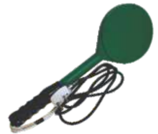
Size: 4" to 18"