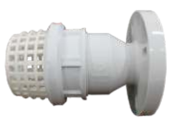
Size : 1" to 2"