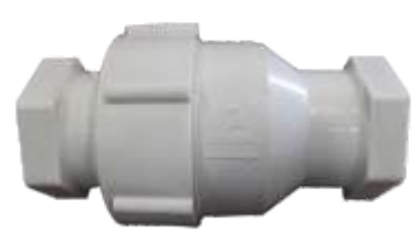
Size: 1" to 4"