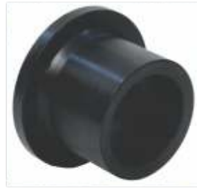
Size : 1/2" to 24"