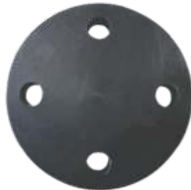
Size : 1/2" to 24"