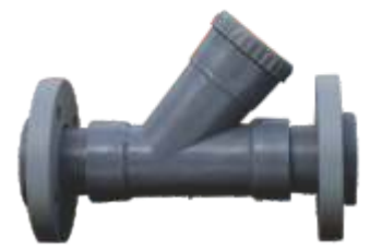
Size : 1/2" to 6"