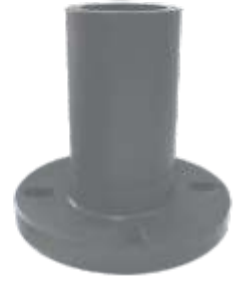
Size: 1" to 4"