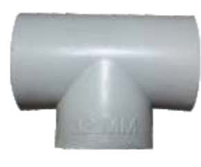
Size: 1/2" to 6"