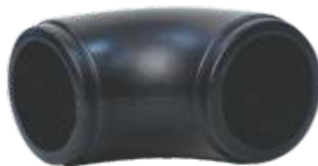
Size : 1/2" to 12"