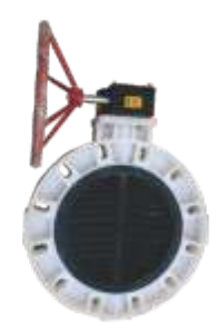
Size: 2" to 12"