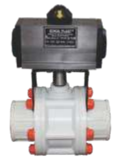
Size: 1/2" to 4"