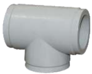
Size : 1/2" to 6"