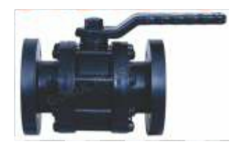
Size: 1/2" to 12"