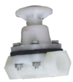
Size: 1/2" to 2"