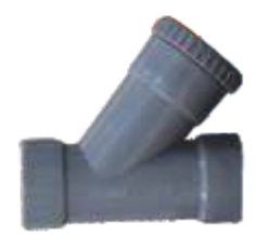
Size: 1/2" to 4"