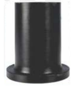
Size: 1" to 6"